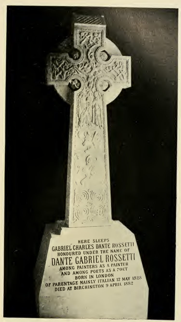
THE GRAVE-CROSS OF DANTE ROSSETTI. Designed by Ford Madox Brown, 1883.